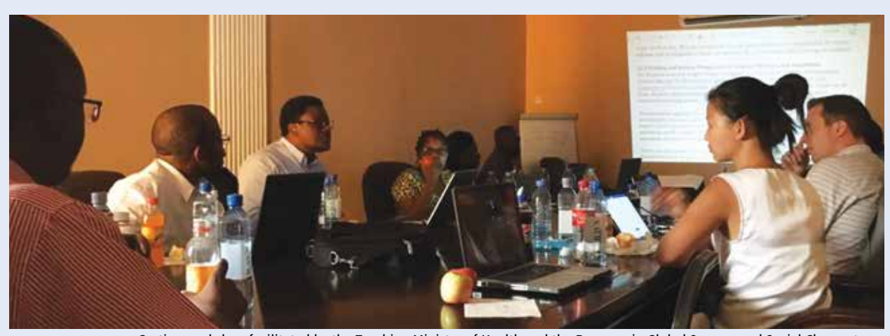
Costing\ workshop\ facilitated\ by\ the\ Zambian\ Ministry\ of\ Health\ and\ the\ Program\ in\ Global\ Surgery\ and\ Social\ Change\ team

regulatory bodies, cooperating partners, the private sector, and the general public. The plan was developed using an important framework covering the following domains required for surgical care: infrastructure, service delivery, workforce, financing, and information management. These domains are codependent and can only be effective with corresponding developments in other areas.