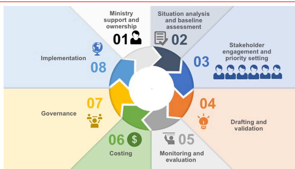
Fig. 1 NSOAP theoretical framework

Drawing on experience, expertise, and lessons learned from countries and implementers around the world, topics covered included (1) the global burden of SOA conditions; (2) the key principles and components of NSOAP development; (3) the critical evaluation and feasibility of different models of NSOAP implementation; and (4) innovative financing mechanisms to fund NSOAPs. Participants noted the importance of advocacy and critical role of data-driven and data-supported arguments to highlight the critical need for improved SOA care for all people. Key arguments for